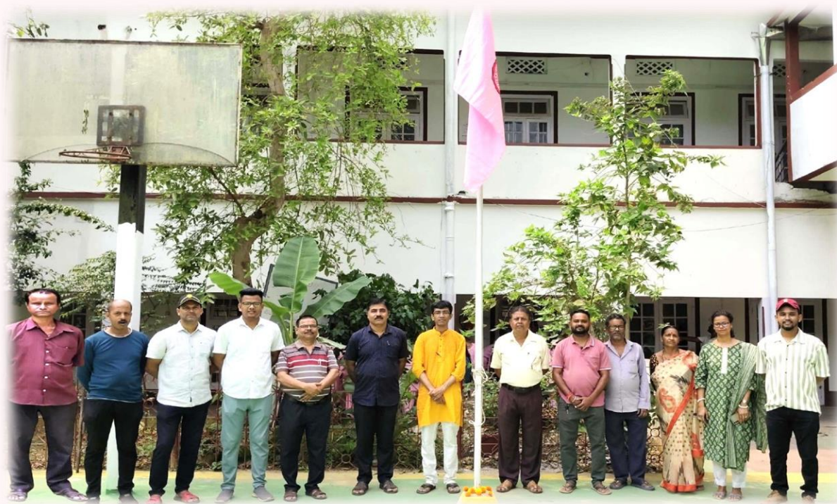
Office staff of the college